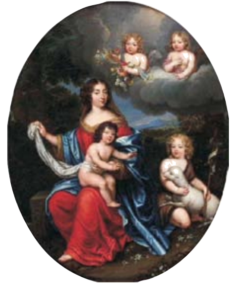
Portrait of Madame de Maintenon, with the King's illegitimate sons

The focus upon salvation rather than pleasure translated for both of them into a desire to lead a meaningful life, one whose meaning was tangible and capable of being measured. This focus also created a dilemma because, in order to achieve the type and level of greatness they each desired, it would be necessary to employ methods that could arguably jeopardize the very salvation they sought to earn.