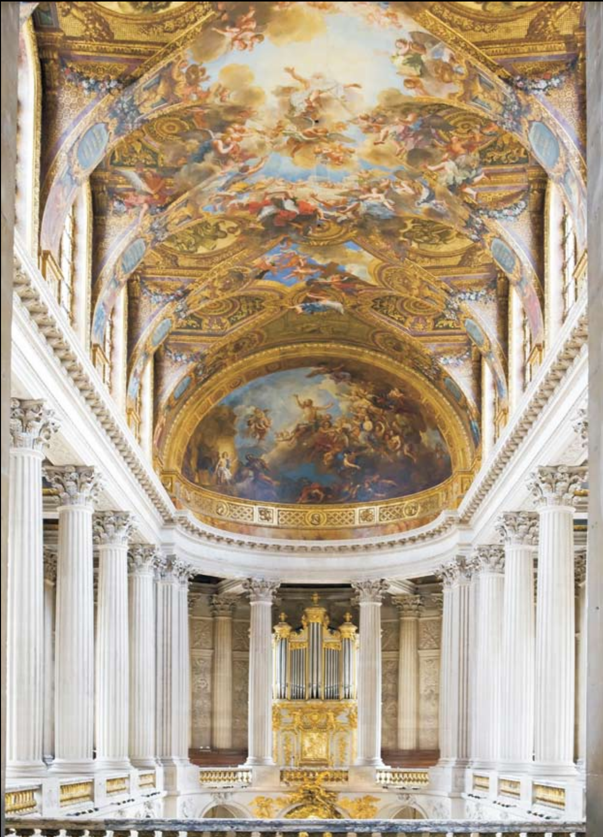
Royal Chapel of Versailles

“May God keep us steadfast as He kept them steadfast, and in joy or in sorrow, may we know, as they knew, that underneath are the Everlasting Arms”.