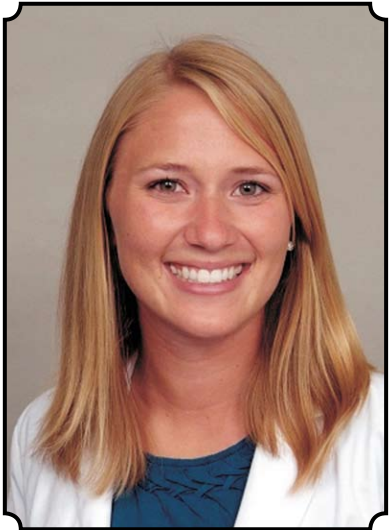
Amelia Baldwin Fromherz Scholarship Winner - 2010

"Thanks to four years of hard work in college, I am thrilled to be a member of the class of 2012 at Louisiana State University School of Medicine in New Orleans. With these years behind me, I am both nervous and elated to move forward in my education in hopes of becoming an emergency medicine physician."